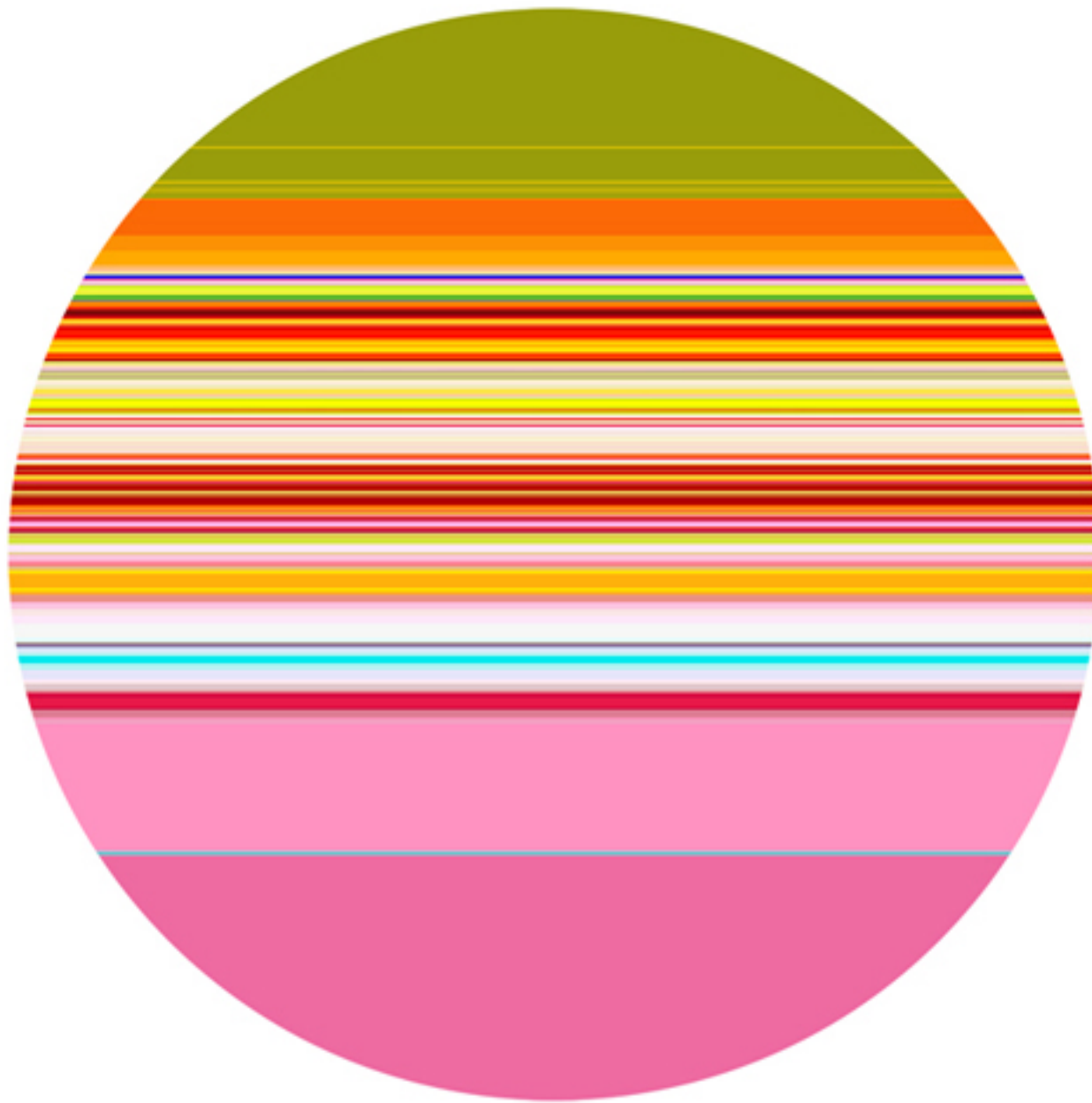
Intersect # 201401 2015 Lambda Print facemounted to 6mm acrylic edition of 1 + 2 AP 118 cm diameter $4,600